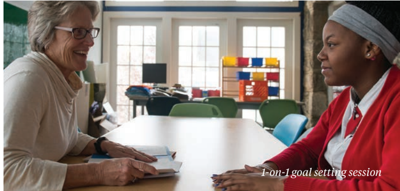
1-on-1 goal setting session

I feel the presence of God in this place. I see the love and care the staff give to the students through sharing their own faith in God. They are committed and dedicated to promoting a faith-filled education to their students.